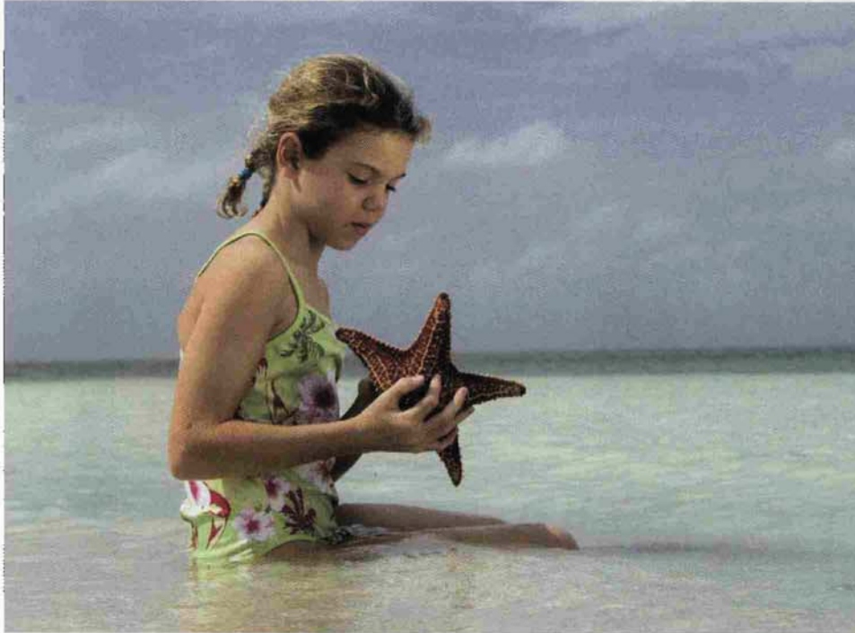
The Ritz-Carlton, Grand Cayman offers the Ambassadors of the Environment program, where kids learn about the resort's tropical surroundings.

Xbox, PlayStation and Wii consoles as well as a wide screen for movies and live DJs every night.