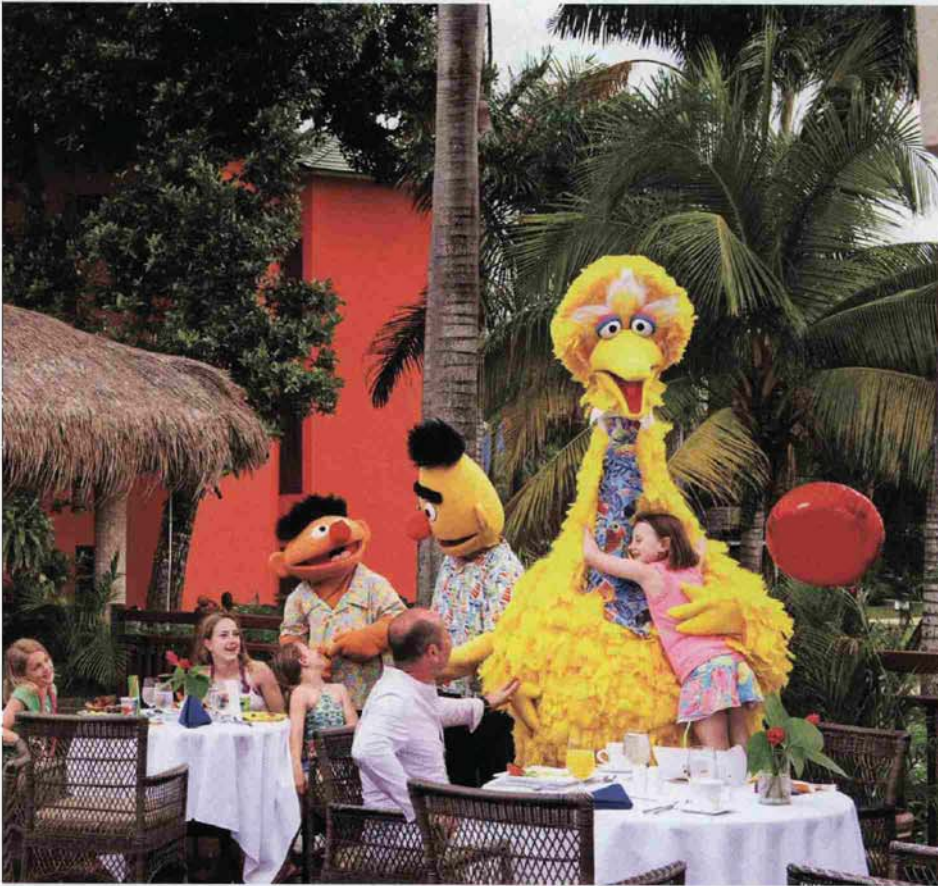
Character breakfast at Beaches Turks & Caicos.

beach, families come together for dinner at any of Beaches' 16 restaurants, ensuring there's a meal for even the pickiest eater. Rates start at $500 pp per night; children 2-16 stay for $105 per child per night. Contact: (888) BEACHES; beaches.com