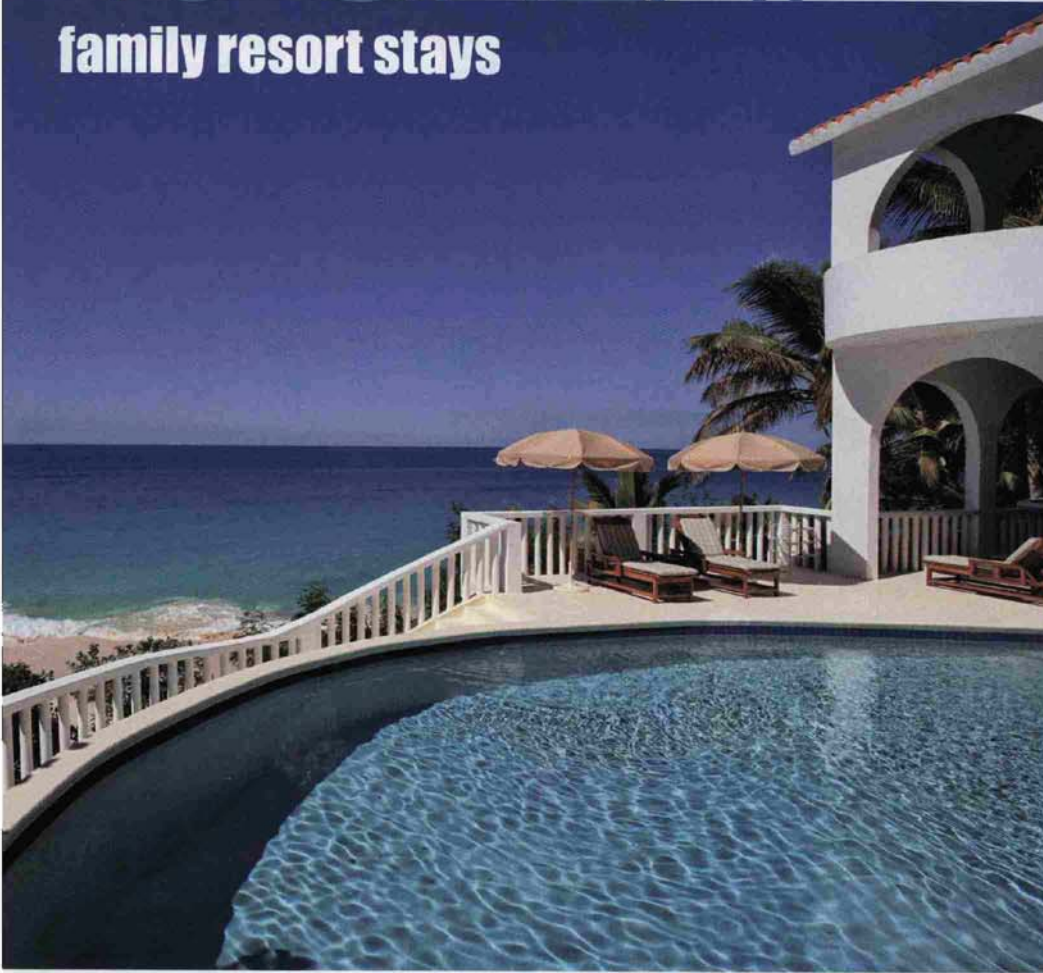
Poolside at the Malliouhana in Anguilla.

Kids and the Caribbean—it's a perfect pair. From the natural playground of their shores to man-made attractions like water parks and kids' clubs, the islands are a great pick for family travel. Here are some of the best family experiences in the region.