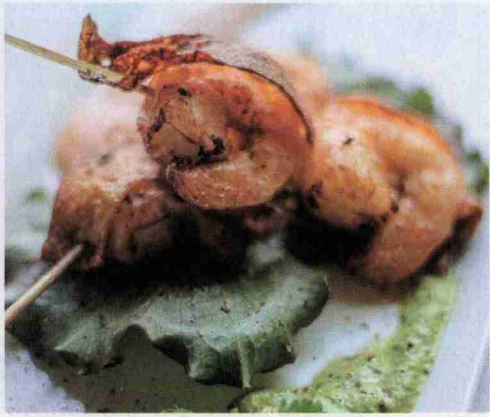
CLOCKWISE FROM TOP RIGHT: PARADISUS PALMA REAL; GEEJAM HOTEL; SONESTA MAHO BEACH RESORT; SILVERLIGHT PHOTOGRAPHY, TORONTO; COURTESY COCONUT BAY BEACH RESORT & SPA, SAINT LUCIA; SAINT LUCIA TOURIST BOARD; GRAND ISLE RESORT AND SPA, LONDON; JACOB PHOTOGRAPHY; COURTESY MALLIOUHANA, AN AUBERGE RESORT; GIDSONPHOTO.COM