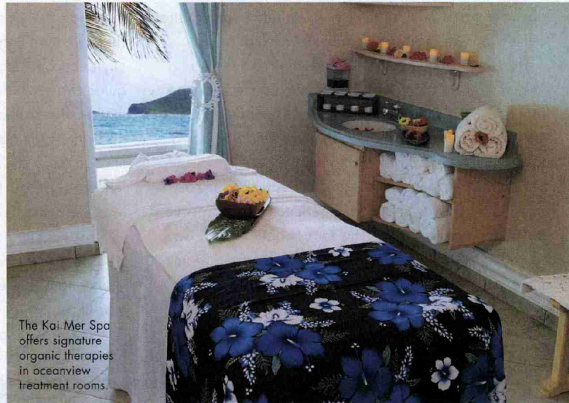
The Kai Mer Spa offers signature organic therapies in oceanview treatment rooms.

Bartenders will be mixing their signature cocktails at the expanded Lobby Bar, featuring a 360-degree service area ensuring this popular gathering spot will be hotter than ever, with new fire pits